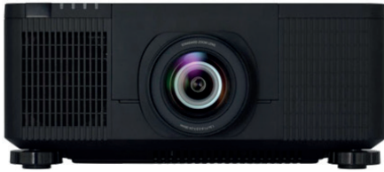
Lens not included